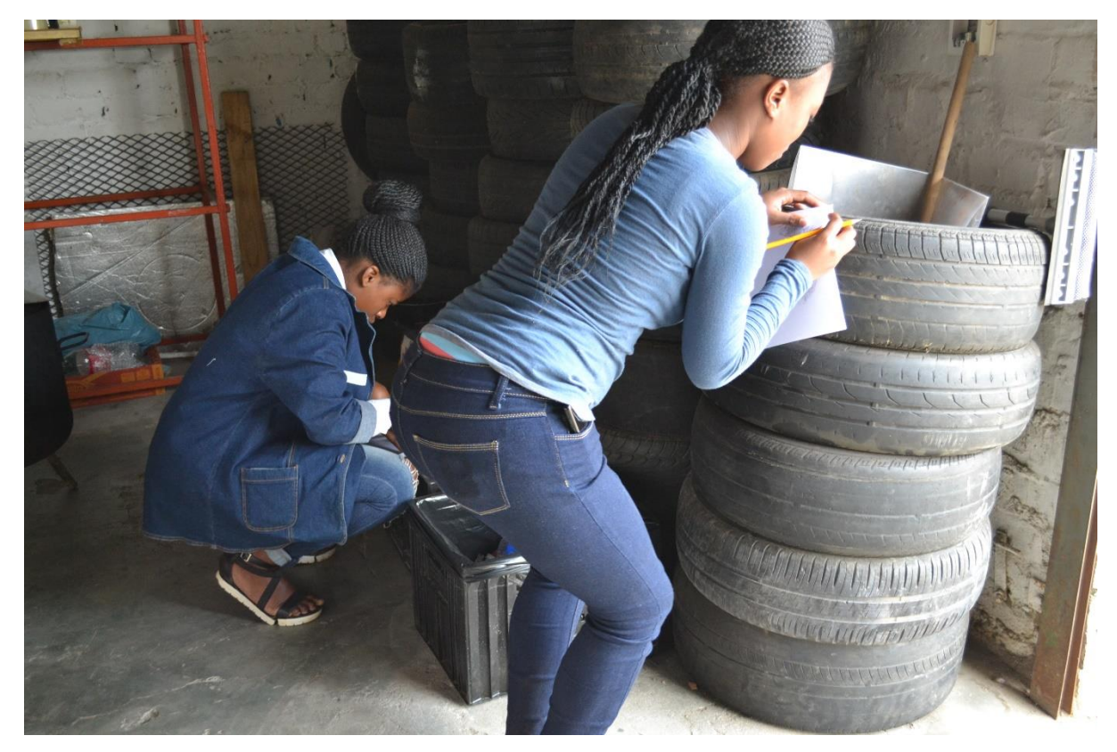
Image 9. Learners doing surface rubbings for printmaking workshop in lino cut technique