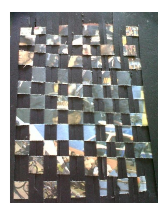
Figure 9 Paper weave Student T1