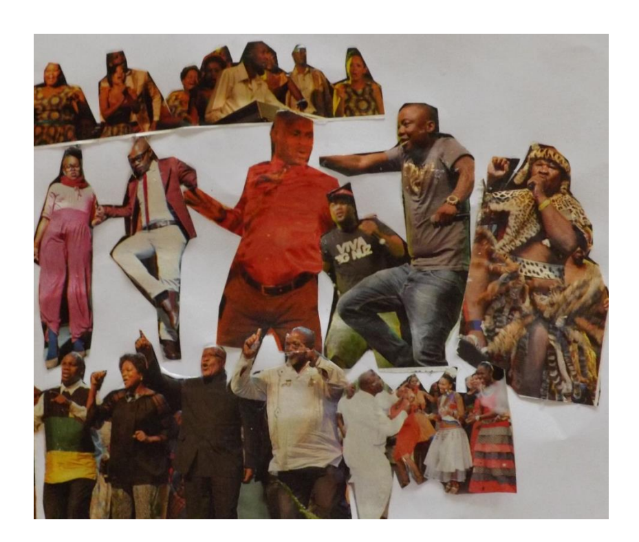
Figure 4 Montage Student S1