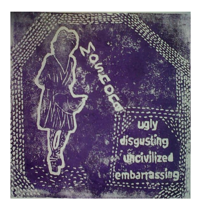
Figure 2 Lino Print Student S3