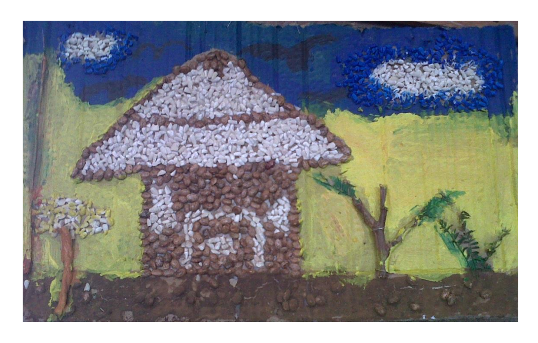
Figure 11 Collage Student F1