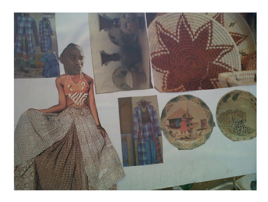
Figure 8 Montage Student F2