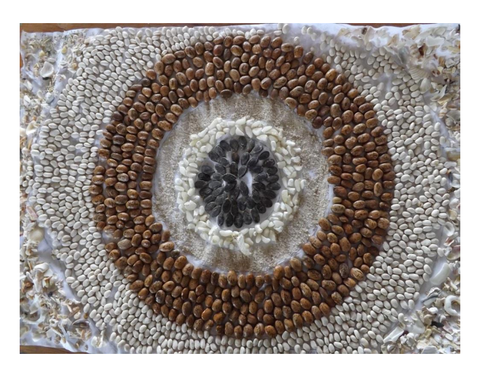
Figure 3 Mosaic Student M2