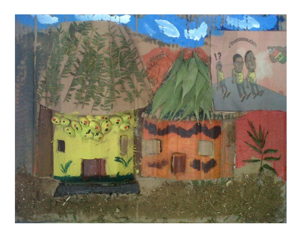
Figure 12 Collage Student M3