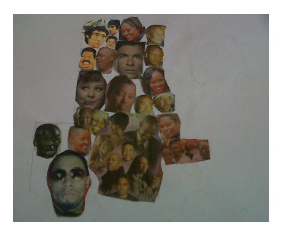
Figure 6 Photo montage Student F3