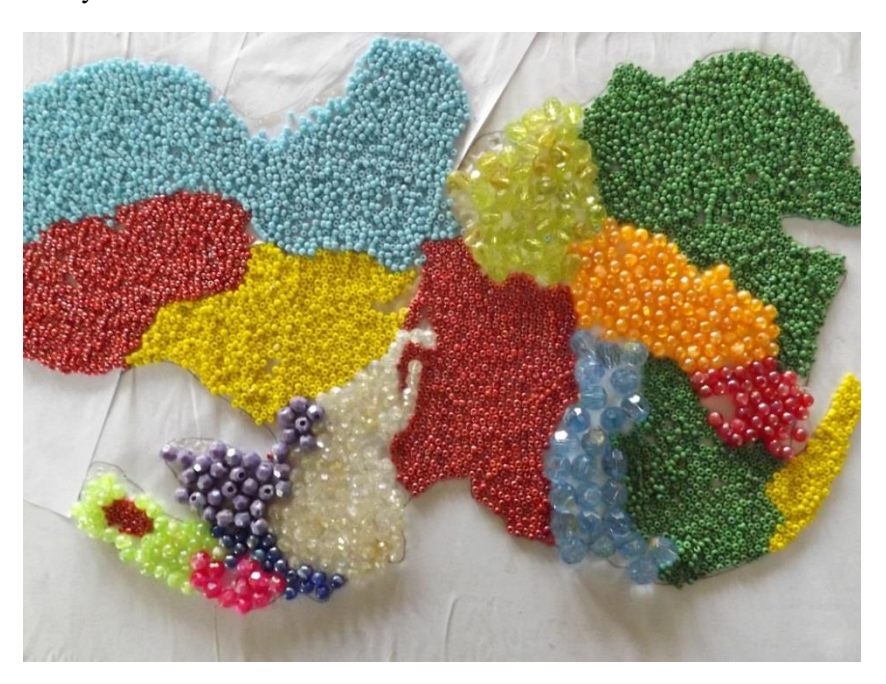
Figure 1. Student M1. Mosaic

They talked openly about experiences with less fear or vulnerability about sharing their thoughts as they worked on their project. The projects created opportunities for students to examine topics of culture, diversity, and social justice in a traditional classroom and within the local context of their community.