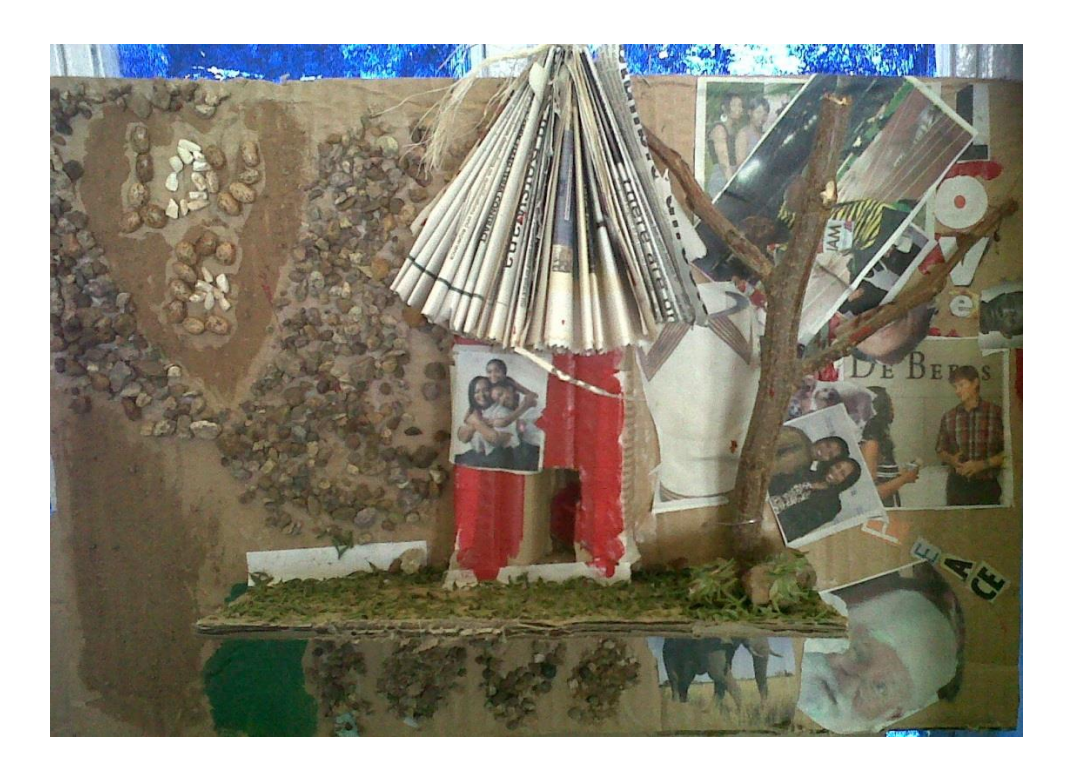
Figure 10. Collage Student K1