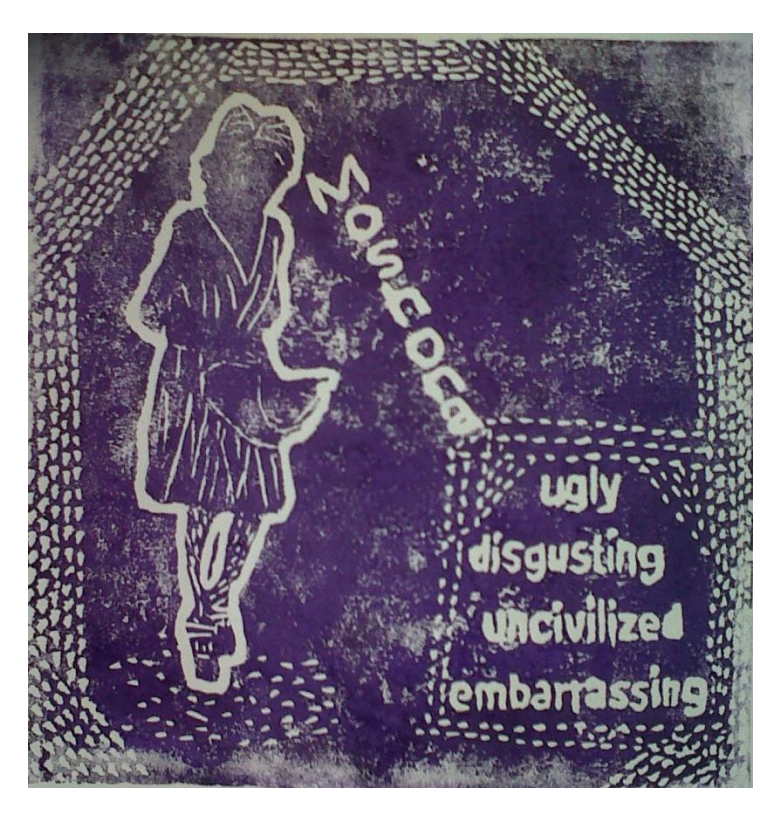
Figure 2. Lino print Student S3.

Her work tackled stigmas and stereotypes which challenge how Mashona are viewed Fig 2 below.