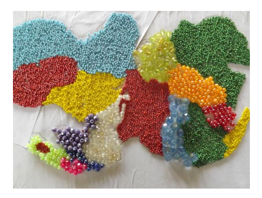
Figure 1 Mosaic Student M1