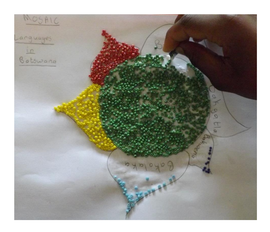
Figure 5 Mosaic Student S2