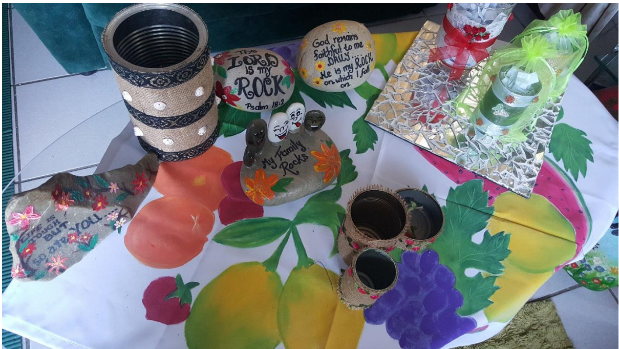
Figure 6: Various items and doorstops