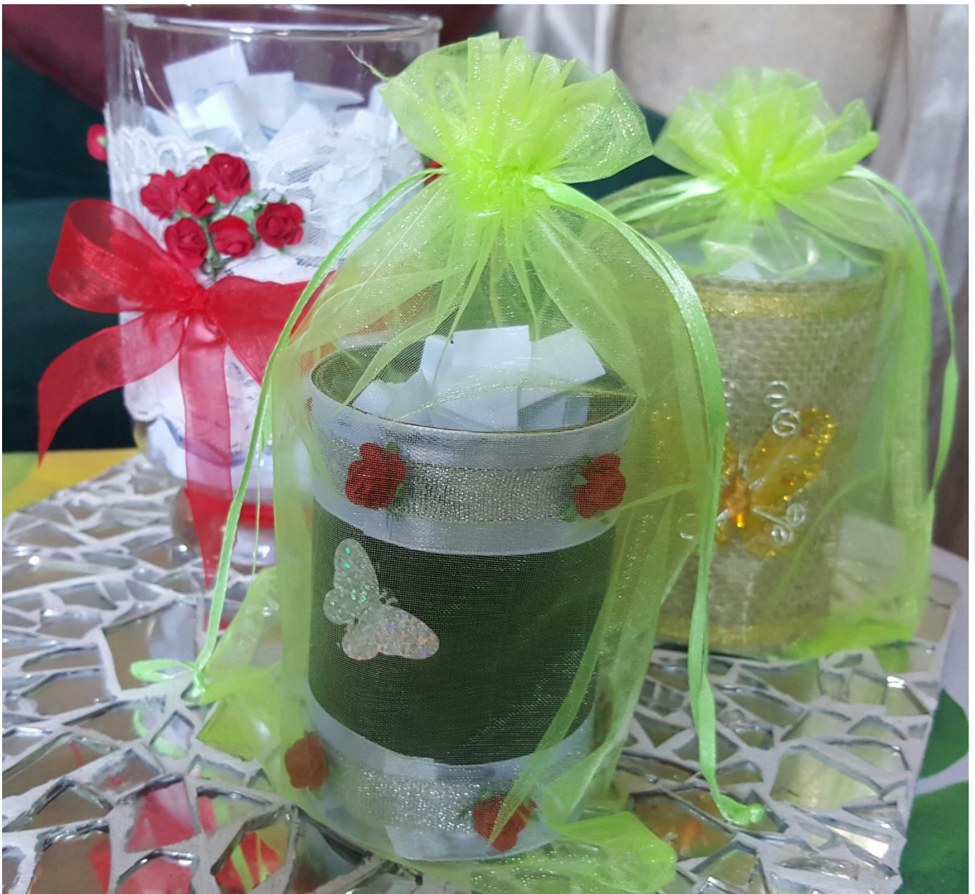
Figure 1: handmade gift crafts

These are made in various forms containing words of encouragement and Bible verses. Dorothy gives these to those she feels need encouragement.