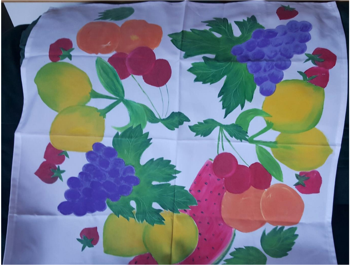
Figure 7: painted tablecloth