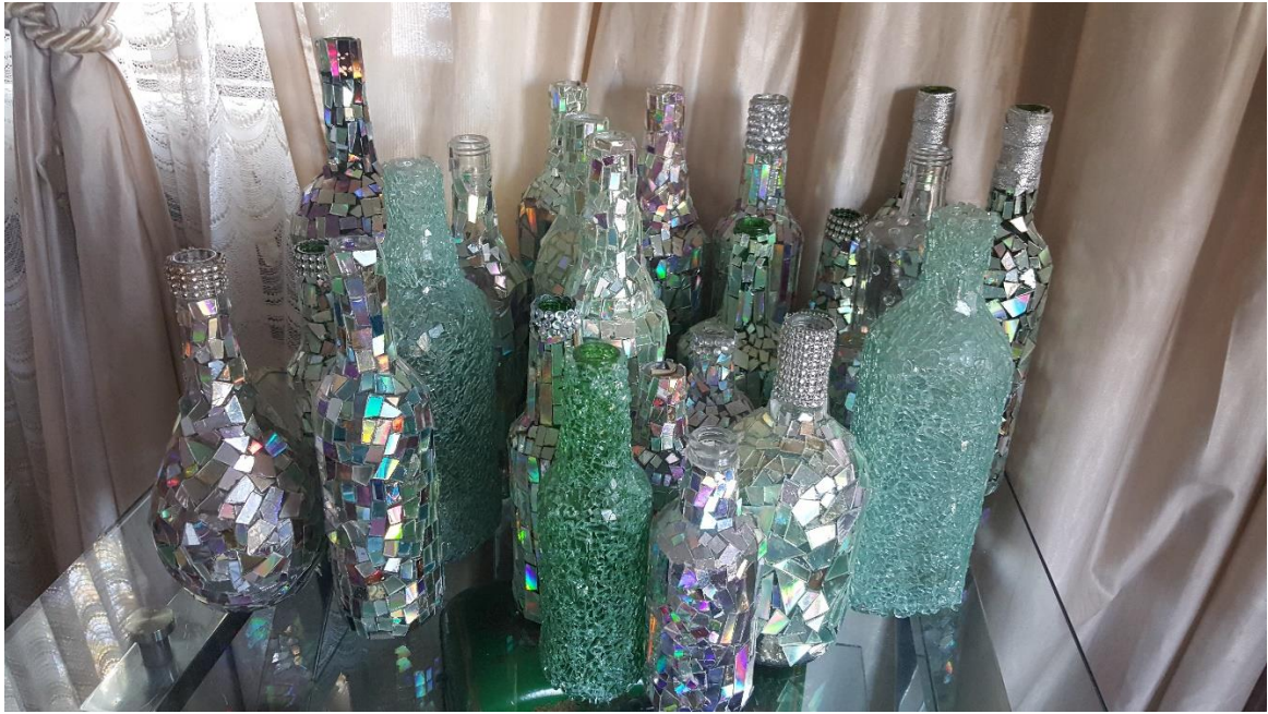
Figure 3:Glasses and bottles decorated with pieces of broken CD's and glass

One of her new projects is making bags. All handmade and not using sewing machines.