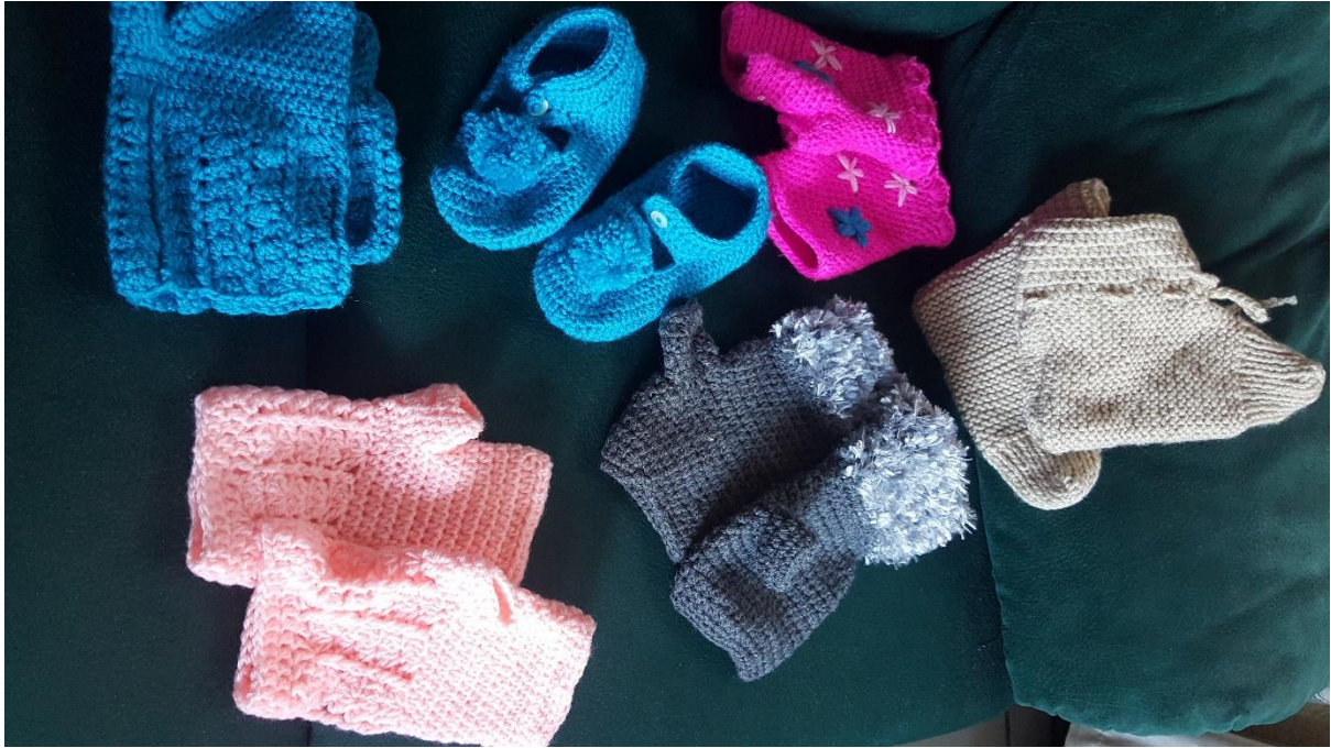
Figure 5: Knitted goods