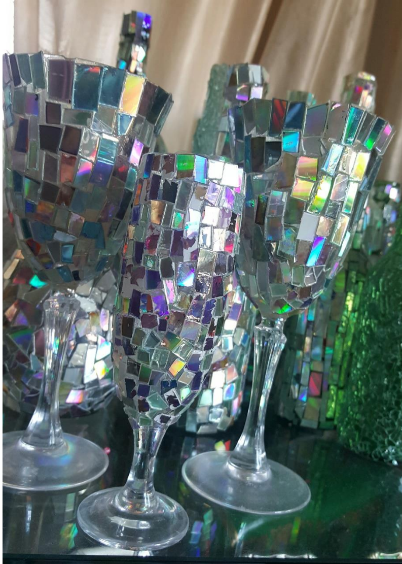
Figure 2 : Glasses and bottles decorated with pieces of broken CD's and glass