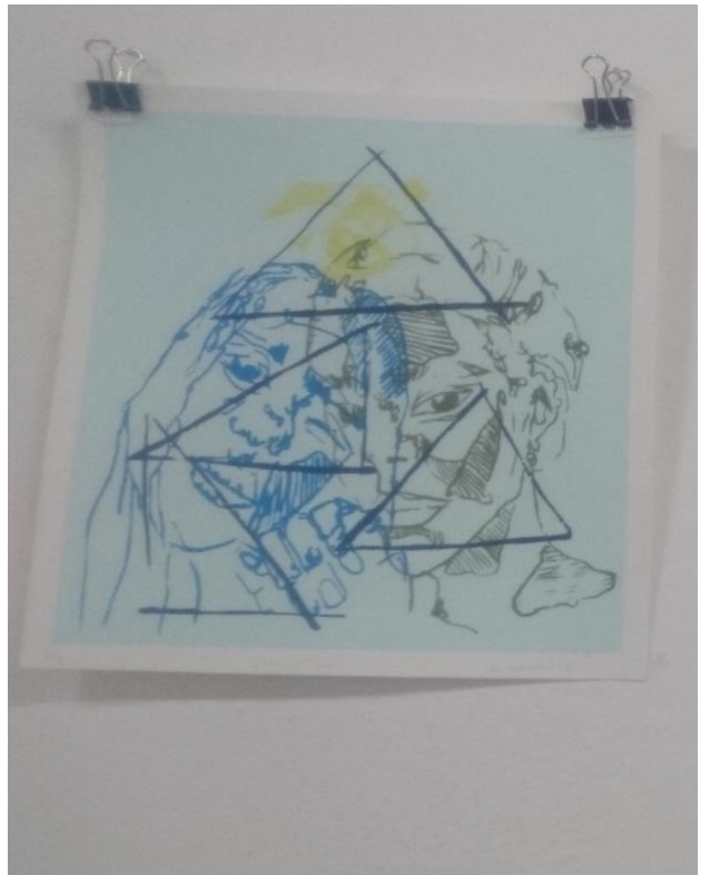
Figure 3: Student 11, Imported and Made (2017). silkscreen print on paper