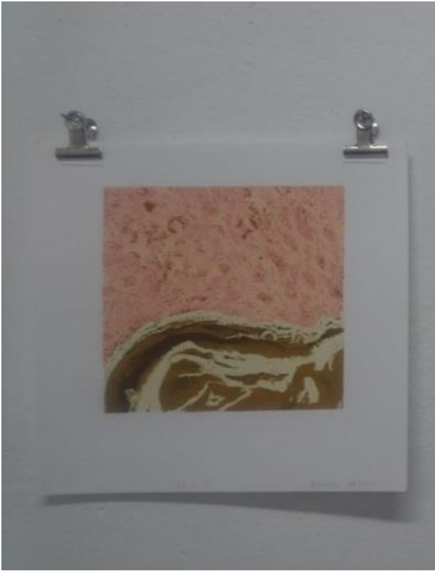
Figure 4: Student 4(W), Skin 1 and Skin 2 (2017). Silkscreen print on paper