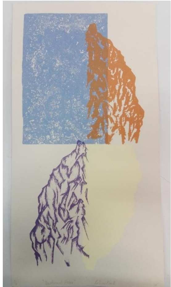
Figure 5: Student 15(I), The Flower and the Arrow (2017). Silkscreen print on paper