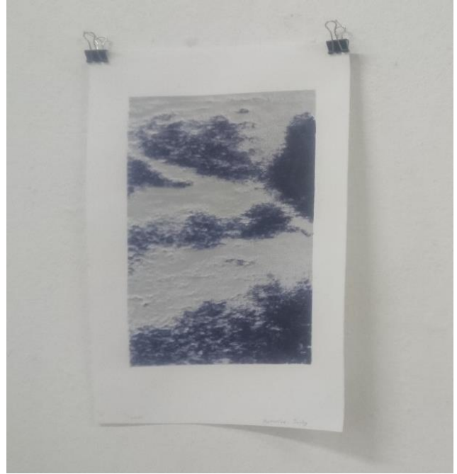
Figure 7: Student 17: (C), Lumps (2017). Silkscreen print on paper