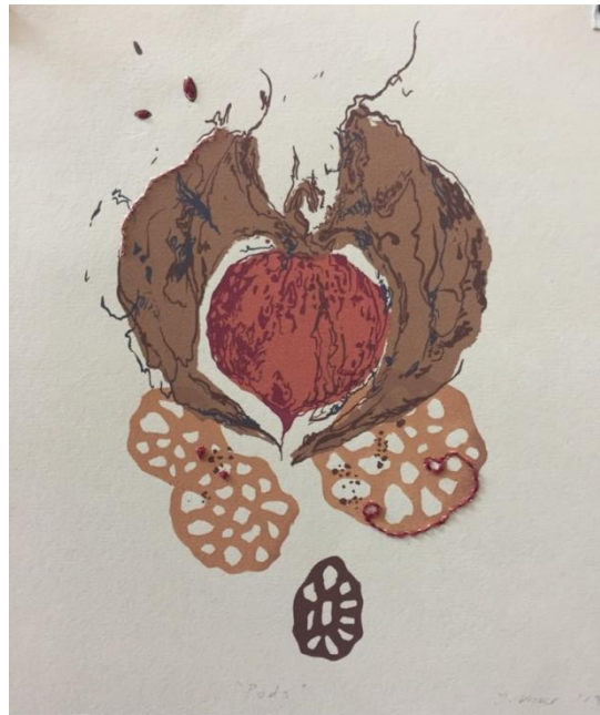
Figure 2: Student 10(W), Adapt(ability) (2017). Silkscreen print on paper