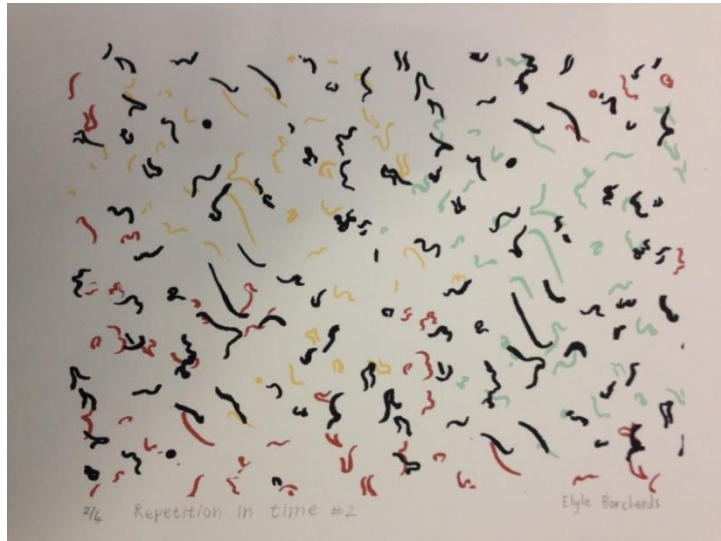
Figure 6: Student 8(W), Repetition in Time (2017). Silkscreen print on paper