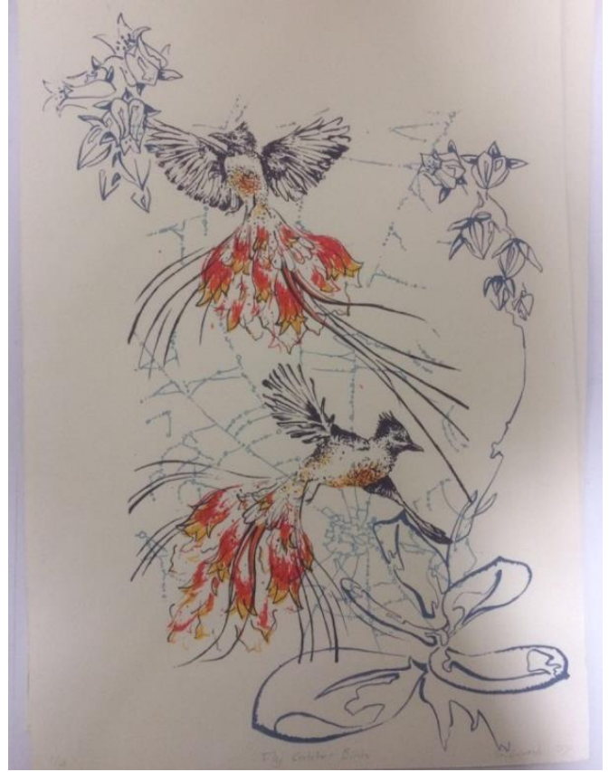
Figure 1: Student 13(W), Fly Catcher Birds (2017). Silkscreen print on paper